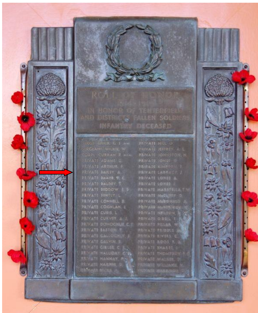
Tenterfield & Districts Infantry Roll of Honour